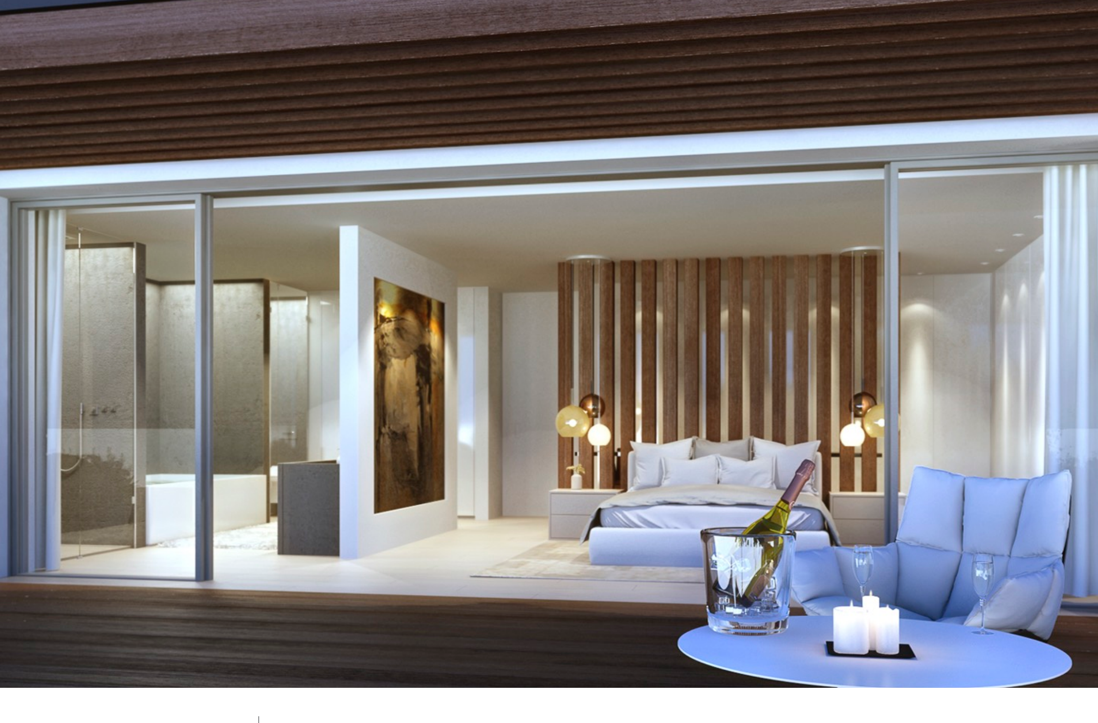
The Master Bedroom